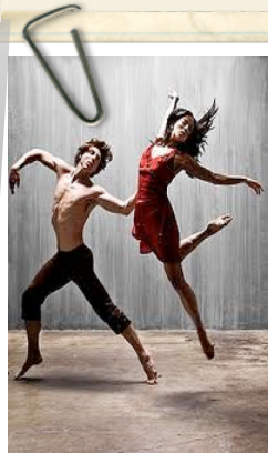
Dance at U Washington

826 Seattle is a nonprofit tutoring center dedicated to helping students improve their narrative and expository writing skills. While visiting, my class worked together to write a 'choose your ending' book, where each chapter concluded with multiple endings from which the reader could select. This was my favorite field trip! For more information check out 826Seattle.org .